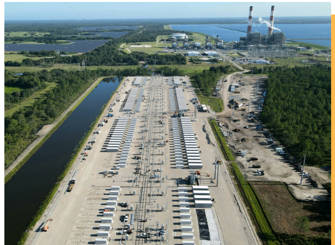
Manatee Solar's Battery Storage Site

Florida Power and Light Co.'s Manatee Solar Energy Center is among the largest solar installations in Florida and has enough electric capacity to power more than eight thousand homes. In late 2021, the site will become home to the world's largest solar and battery storage integrated facility. The new battery installation will store the energy generated by the solar panels during the day to be used when the sun is no longer shining and energy demand is at its highest, which will result in significant fuel cost savings for Florida rate payers in the coming decades.